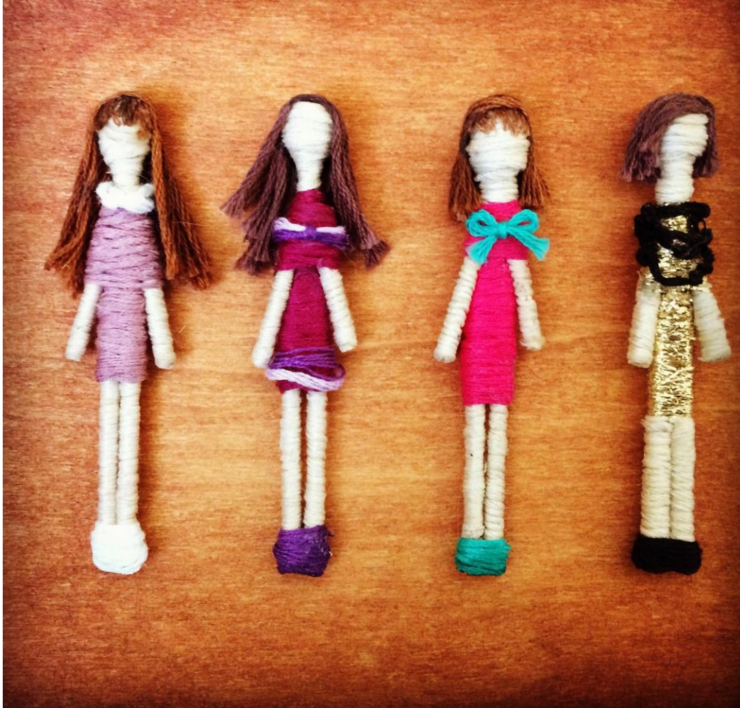
(tooth pick dolls)

Tuesday evenings at Emanuel 6:30PM to 8PM in the Fellowship Hall